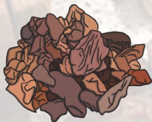
Dried and roasted cocoa